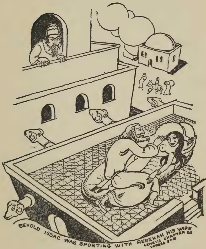
BEHOLD ISSAC WAS SPORTING WITH REBEKAH HIS WIFE GENESIS CHAPTER 26 VERSES 9-11